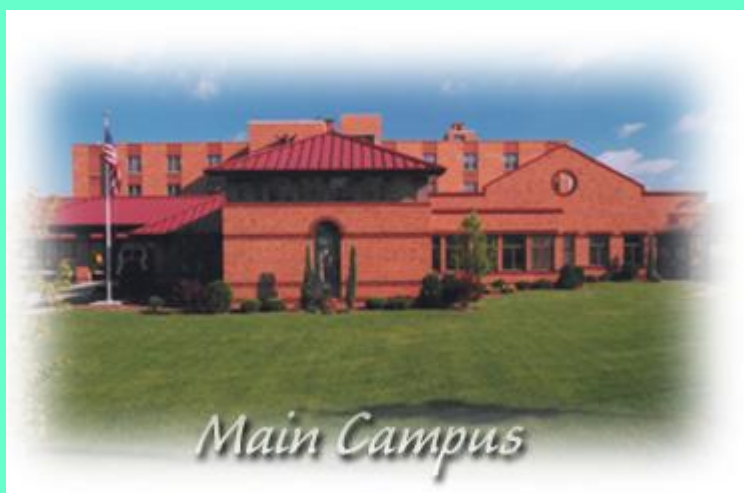
The School at McGuire Memorial