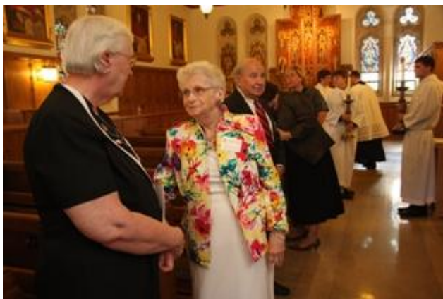
At the Papal Award backstage before the ceremony. with the Diocesan Centenary Awards.